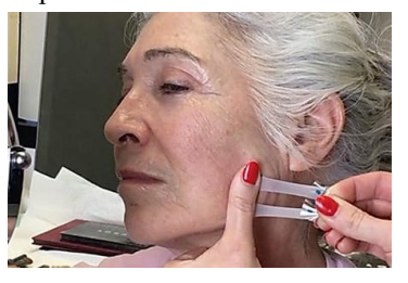
How To: Reduce Sagging Jowls Sponsored by City Beauty