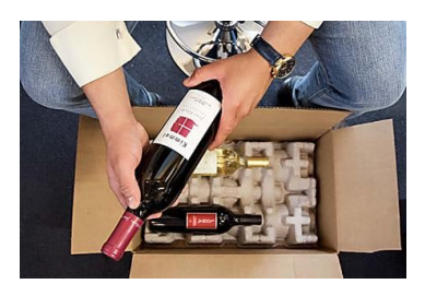
Maryland, Our $5 wines are better than most $50 wines Sponsored by Firstleaf