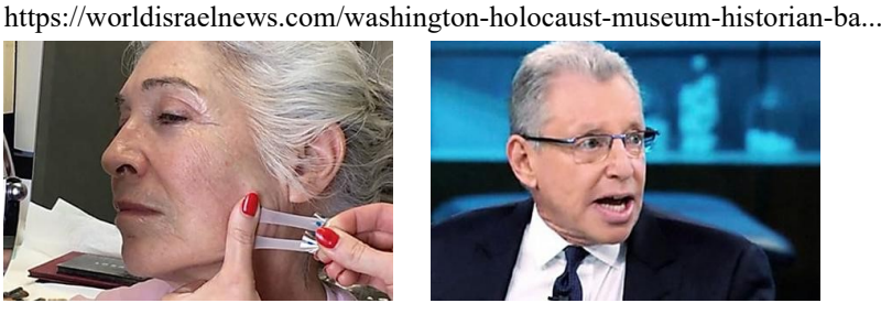
Top US Urologist Says: "Use This To Improve Your Prostate Health" Sponsored by Prostate Supplement